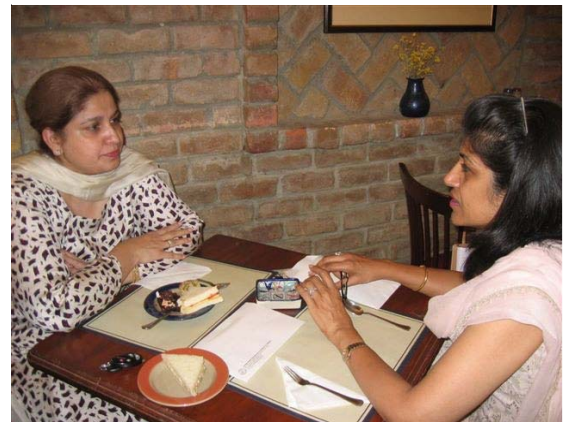
1) Principals and advisers get acquainted with USEFP over tea in Islamabad.

Outreach activity for the coming academic year was kicked off with a get-acquainted gathering with principals in Islamabad over tea.